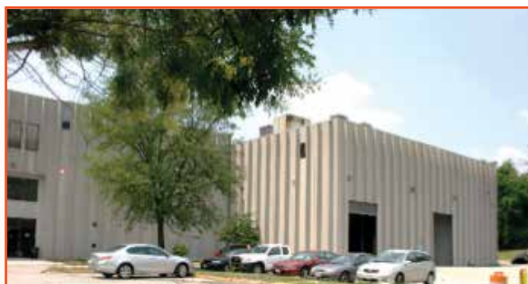
Current location of Morgan's School of Community Health and Policy: a former recording studio

Such is the case with our next major project. The University is proposing the construction of a new Health and Human Services (HHS) building , to be located at the intersection of Hillen Road and Argonne Drive on the site of Turner Armory. The proposed facility will provide space for the School of Community Health and Policy and the School of Social Work, and will house the following disciplines: Nursing, Nutrition, Public Health, Family and Consumer Sciences and Medical Technology as well