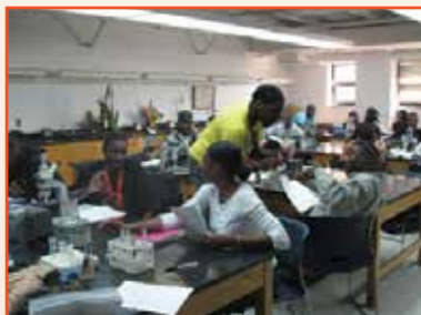
Morgan's Science Complex – Spencer Hall: the building has outdated laboratories, and office space is used to store equipment and experimental materials.